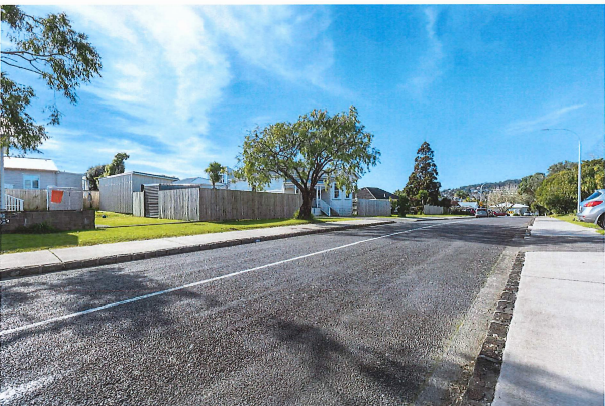
Himikera Avenue, Avondale