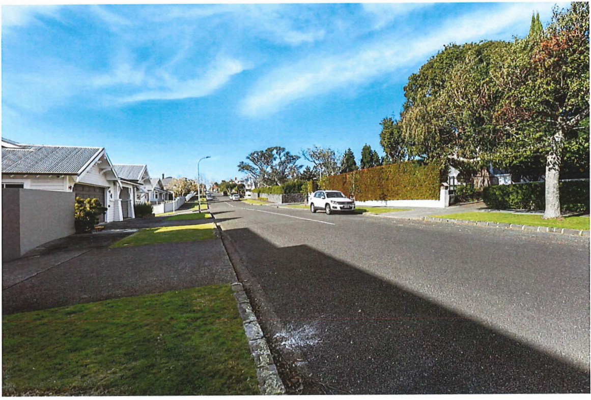
Bella Vista Road, Herne Bay