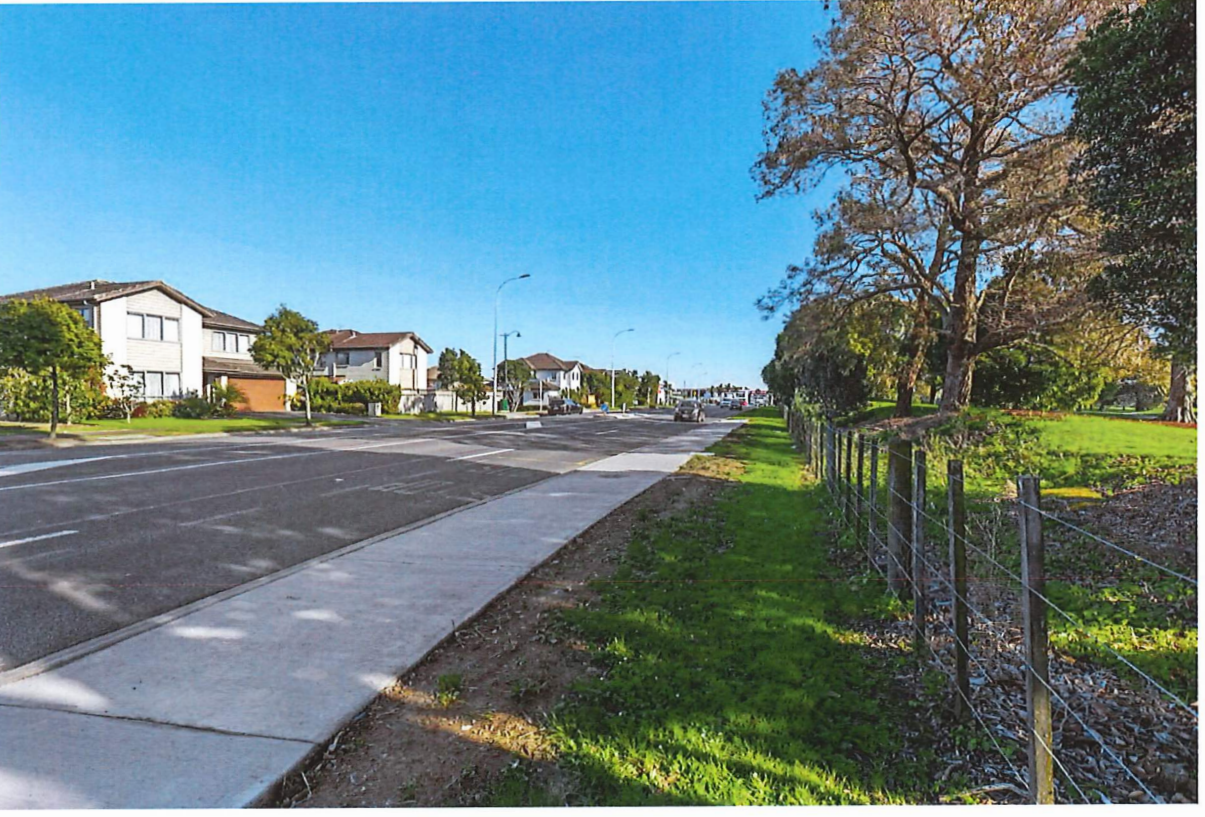
Ngahue Drive, Stonefields