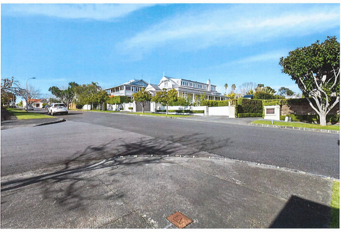
Bella Vista Road, Herne Bay