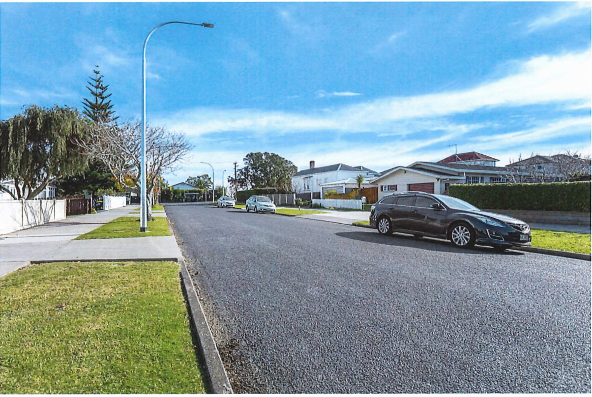
Powell Street, Avondale