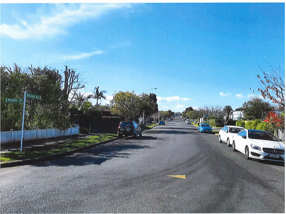
Harbutt Ave, Mt. Albert