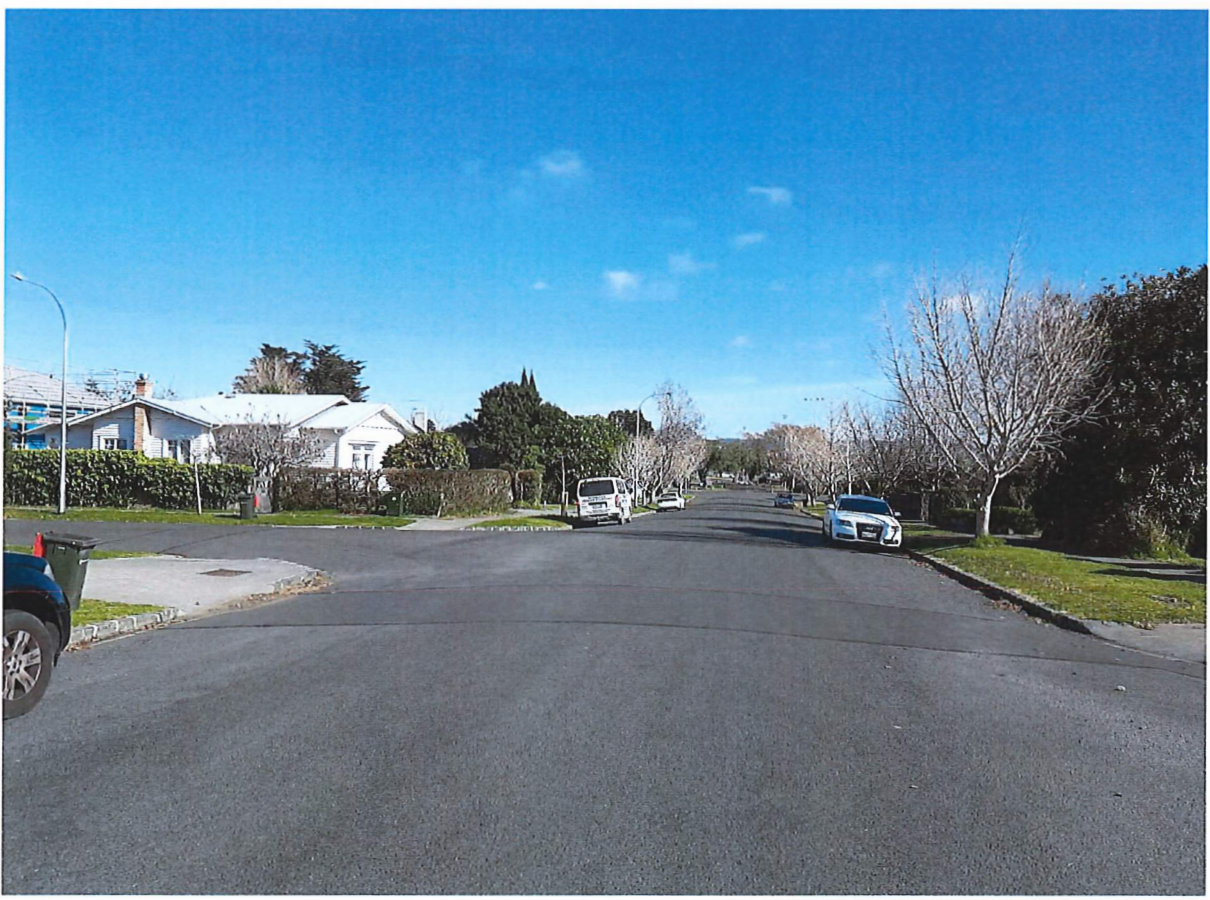
Springfield Ave, Mt. Albert