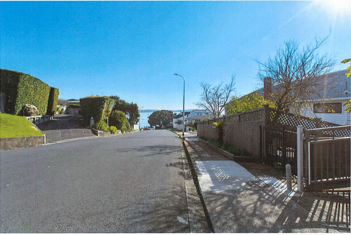
Laings Road, Bucklands Beach