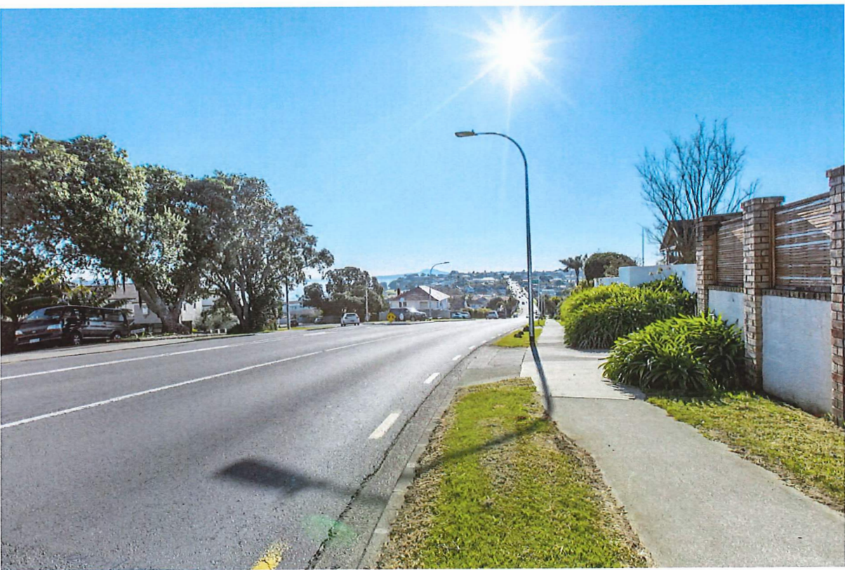
Bucklands Beach Road, Bucklands Beach