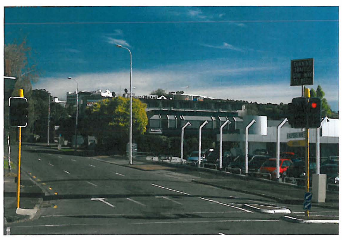
Alpers Ave, Newmarket