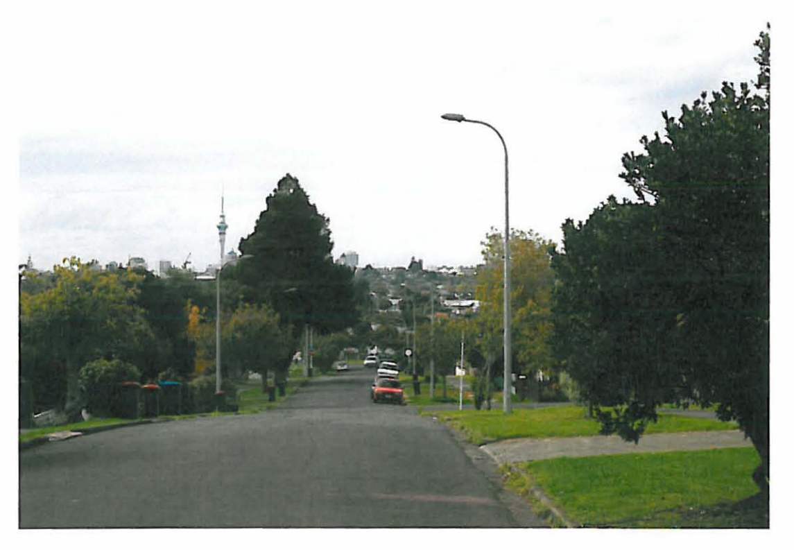
Duncan Ave, Sandringham