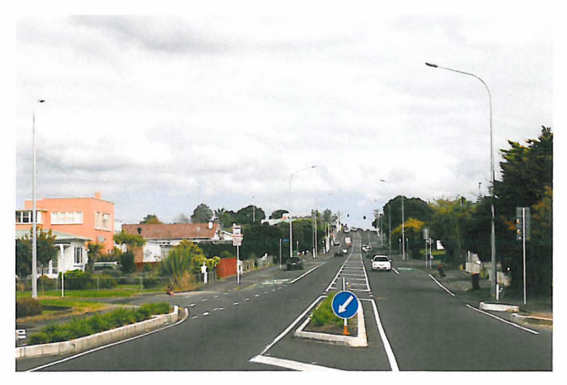
Sandringham Road, Sandringham