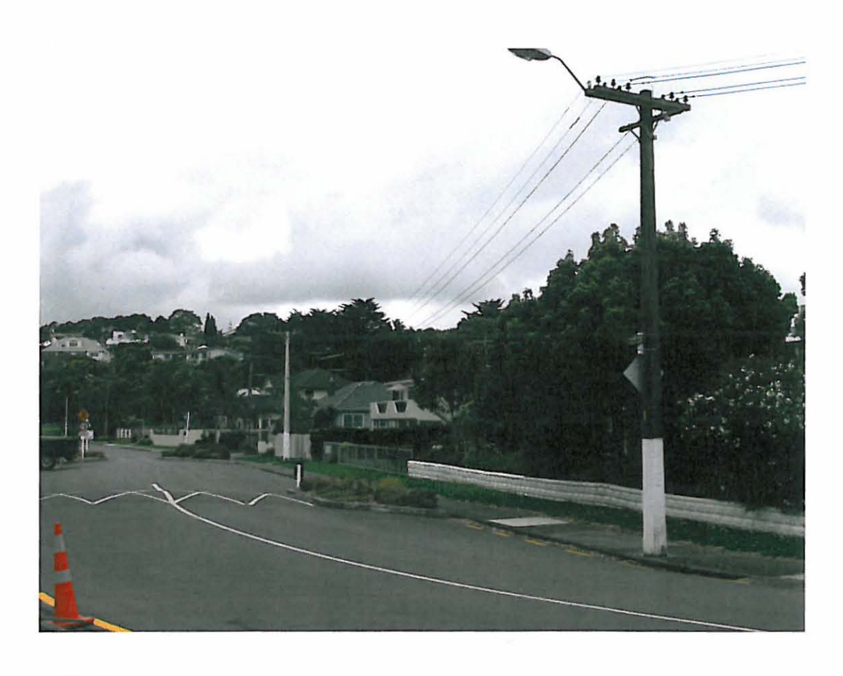
APPENDIX 1: Vector Overhead Improvement Programme 2008/09