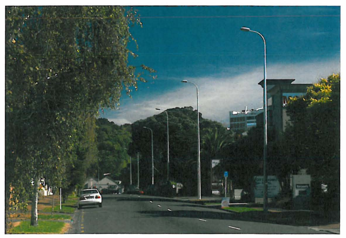
Alpers Ave, Newmarket