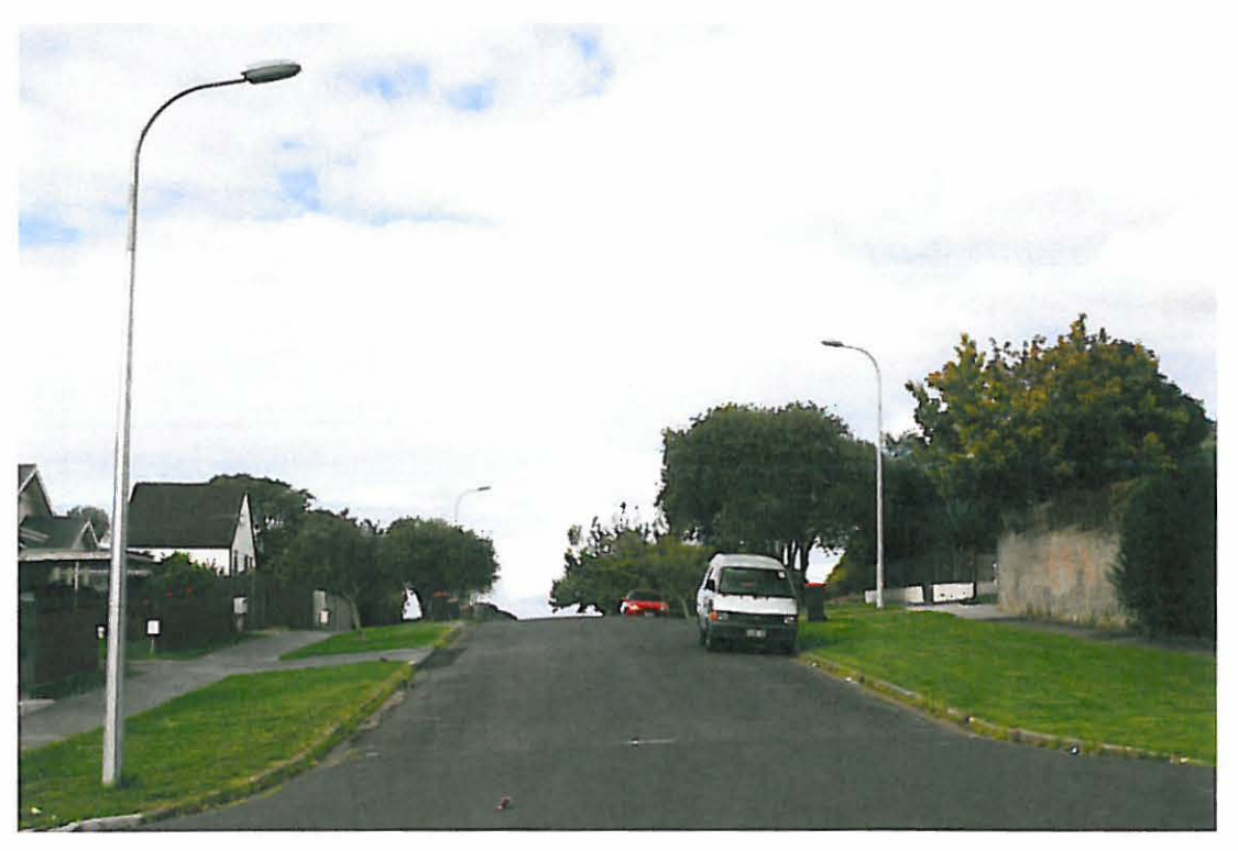
Eden View Road – Sandringham