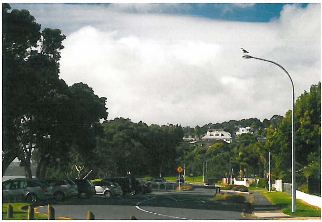
Shelley Beach Parade, Cockle Bay