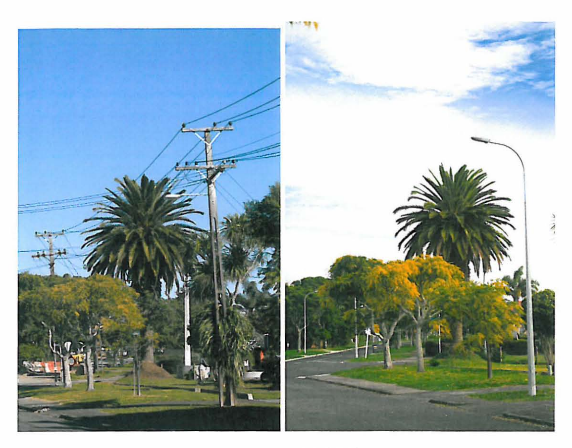
Kiwitea Street, Sandringham