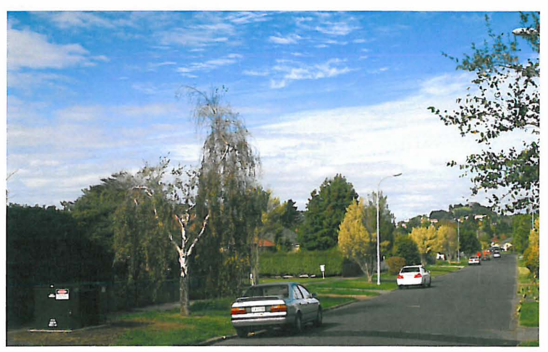
Parry Street, Sandringham