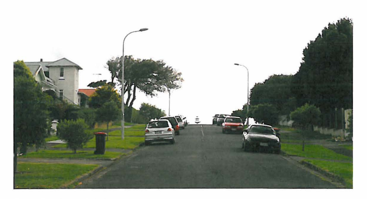
Marne Road, Sandringham